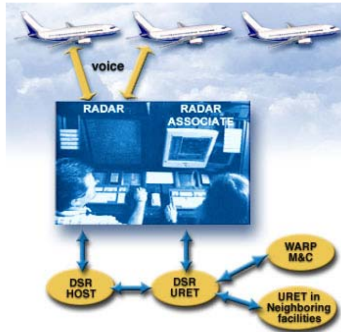
Figure 1: URET System Interfaces.

As part of the URET Conflict Probe deployment, a computer complex of processors is networked to the air traffic Host Computer system and to the DS D-Controller consoles. The network includes interfaces to the Weather and Radar Processor (WARP) for weather data and to Monitor and Control (M&C) positions for system support. The URET conflict probe computer complex is also connected to an external network for communications with systems at neighboring ARTCCs (See Figure 1).